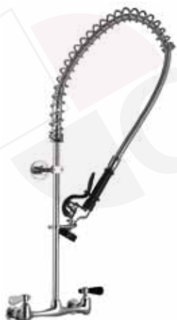
pre-rinse unit with wall-mounted water tap without swivel tap