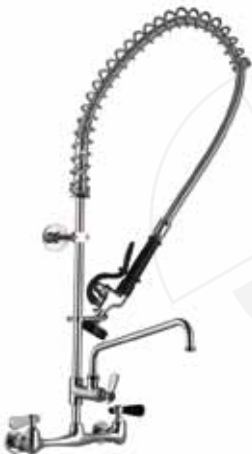
pre-rinse unit with wall-mounted water tap with swivel tap