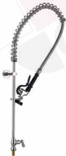
pre-rinse unit with pillar tap without swivel tap