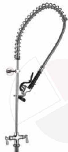
pre-rinse unit with monobloc tap without swivel tap