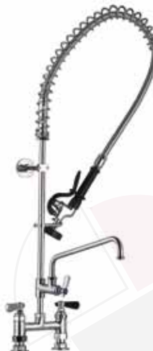
pre-rinse unit with bridge tap with swivel tap