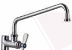
pre-rinse unit with swivelling tap