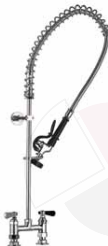
pre-rinse unit with bridge tap without swivel tap