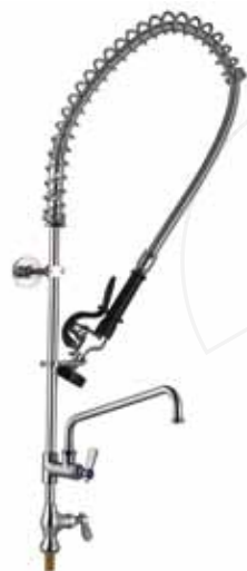
pre-rinse unit with pillar tap with swivel tap