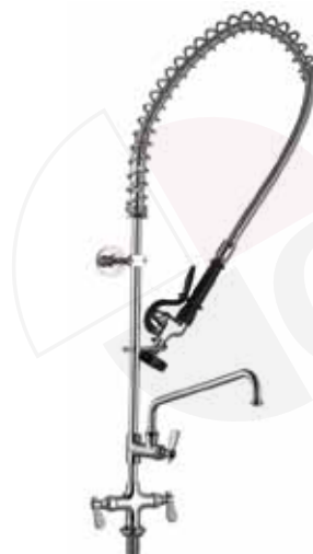
pre-rinse unit with monobloc tap with swivel tap