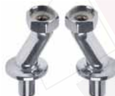
eccentric for bridge tap