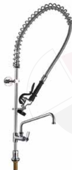
pre-rinse unit without fitting with swivel tap