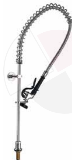
pre-rinse unit without fitting without swivel tap